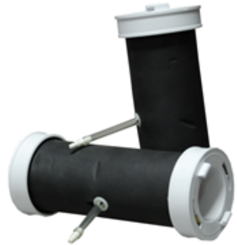
ZONEPAK 2" SDHV Damper (2 or 5 Pack)

ZonePak™ is the smart solution for delivering controlled comfort throughout your environment. Its unique, air-driven damper system is guided by multiple independent, pre-programmed thermostats, creating up to three separate zones of unparalleled comfort while utilizing a single air handler. The select delivery of conditioned air satisfies thermostat needs quickly, allowing the air handler to run more efficiently and reducing overall energy consumption and costs.